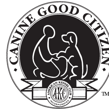
An AMERICAN KENNEL CLUB Program

and BLUE & GREEN ROSETTE offered by the Marquette Kennel Club